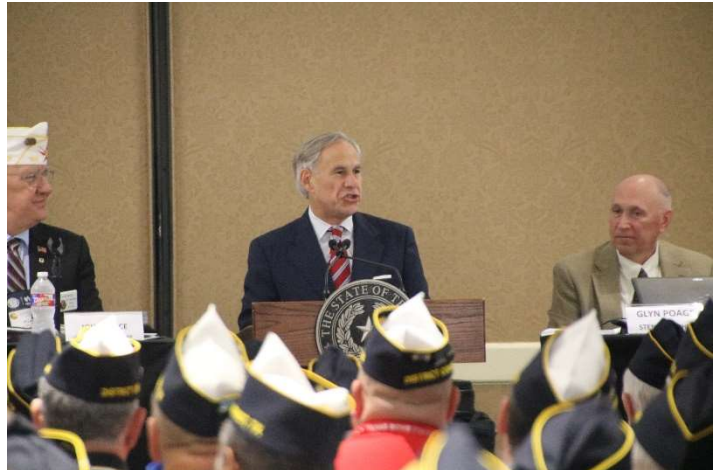
Figure 49 - Governor Greg Abbott Address the 100th Convention of the Department of Texas In San Antonio TX (7/13/2018)