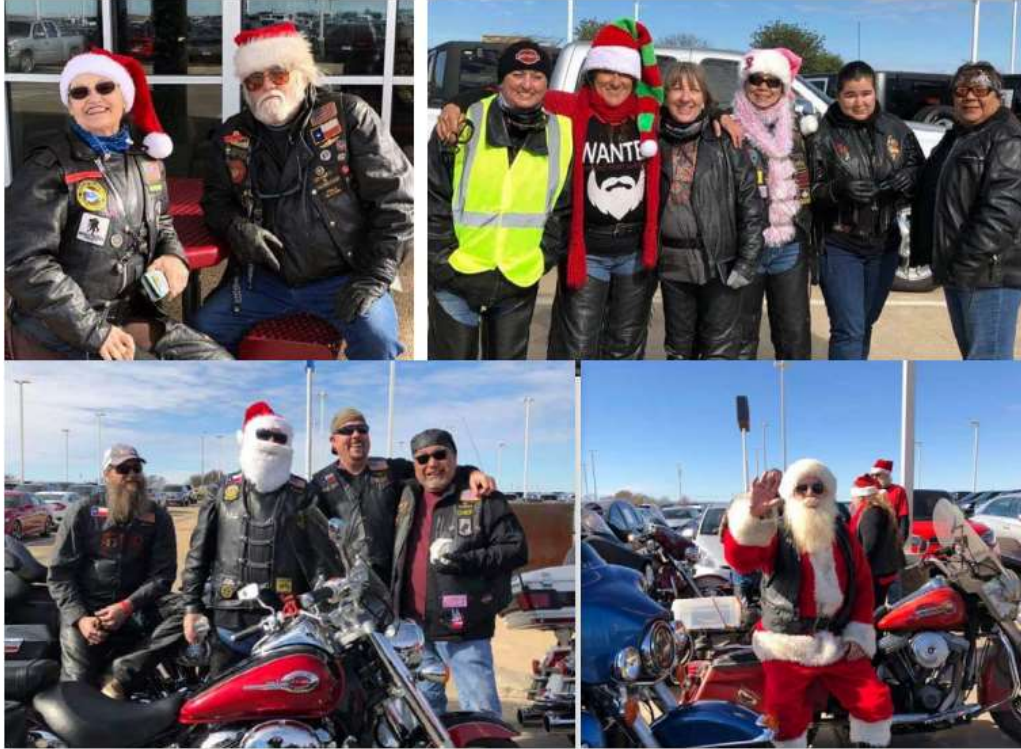
Figure 6 - American Legion Riders from Post 231 participating in the "For The Kids Toy Run"

supporting the 24 th Annual “For The Kids Toy Run” benefiting the local Salvation Army. More than 450 bikers from around the region joined together dressed in leathers and Christmas attire. Bikes were decorated with stuffed animals, wreaths and garland.