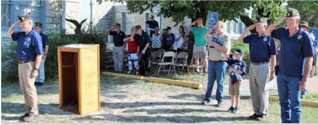
Figure 80 – Post 240 Legionnaires & Scouts salute to the bugle sounds of “To the Colors” as the flag is burning begins.