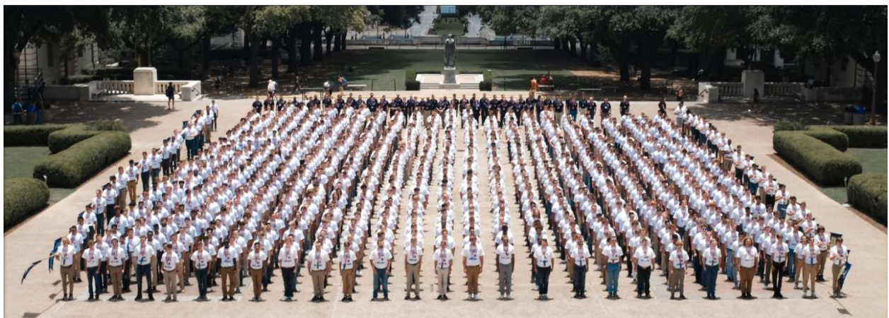
Figure 45 - Texas Boys State Class of 2019 @ University of Texas Austin TX (June 2019)

American Legion Boys State is designed to bring out the best in America's future leaders. Attendees are selected because they are the best representatives of both their schools and their communities. Upon arrival at Boys State each citizen is assigned to one of two "fictional" political parties, which are the "Nationalists" and the "Federalists" at Texas Boys State. The entire program is non-partisan and problems considered are without reference to any existing political party and will be free from propaganda. Because of the time