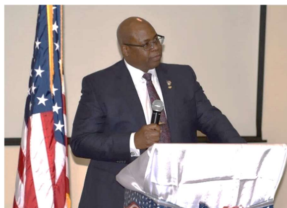
Figure 33 - US Navy (Ret) Rear Adm. Eric Young and Post 828 member addresses attendees of Post 828’s observance of The American Legion’s 100th Anniversary