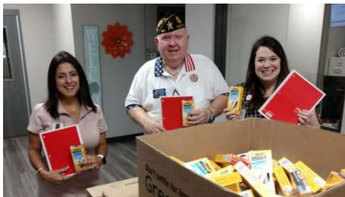
Figure 65 - American Legion Post 164 in Katy Provides Extra Supplies for Two Elementary Schools (August 2018)