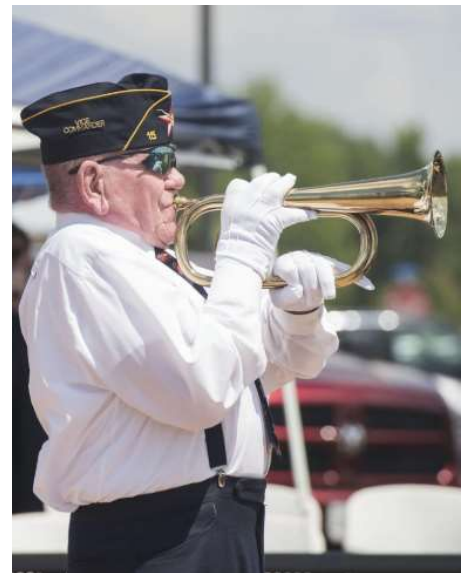
Figure 36 - Post 15 Bugler plays TAPS at Memorial Day Ceremony

(May 27, 2019) People attend a Memorial Day ceremony at the Lindale Veterans Memorial in Lindale on Monday May 27, 2019. The event was hosted by the Lindale Veterans Memorial Committee and Lindale American Legion Post 15. Memorial Day is observed to remember people who served in the United States armed forces and died during their service.