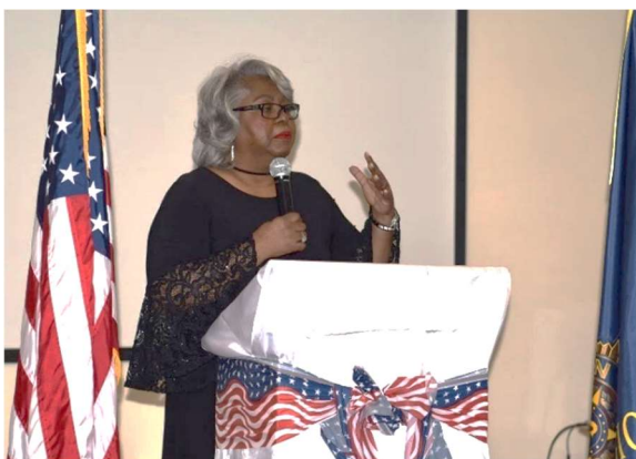
Figure 32 - Texas State Rep. Barbara Gervin-Hawkins addresses attendees Post 828’s observance of The American Legion’s 100th Anniversary. 3/15/2019)