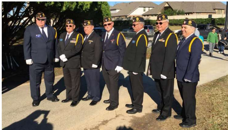
Figure 24 - Members of Post 164's Honor Guard at Magnolia Cemetery in Katy on Dec. 15 for National Wreaths Across America Day ceremonies