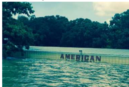
Figure 43 – A flooded Post 231 in 2015

(28 July 2018) The American Legion M.I.A. Post 231, Pottsboro, TX, opened the doors to its new building on December 1, 2018. The old building was flooded and had to be demolished after Lake Texoma hit a record level of 645.72 feet in May of 2015. More than three years later and twelve feet higher, the Post is finally opening its doors again to members and guests.