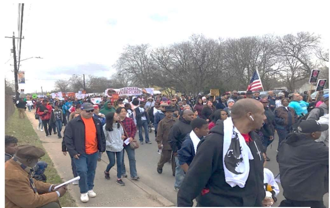
Figure 25 - 2019 MLK Day Parade crowd

The signature event, the annual Martin Luther King, Jr. March, was held Monday,