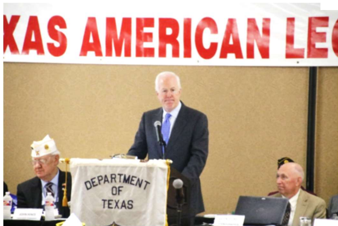
Figure 50 - U.S. Senator John Cornyn address the 100th Convention of the Department of Texas In San Antonio TX (7/13/2018)