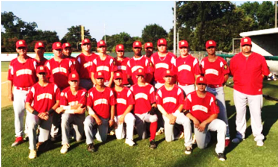
Figure 13 - Tournament Runner-up Post 8 Cannoneers (Ballinger TX)

from Bollinger, and League City Post 554 5A play their American Legion Baseball Tournament game at Fireman's Park. They, along with the Texarkana Prospects, competed for the chance to play at the regional tournament in Denver. So far, 275 Major League players competed in American Legion baseball, many who later went on to play for American Legion Championship.