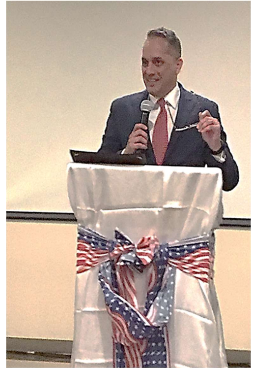
Figure 67- San Antonio District 6 City Councilman Greg Brockhouse (Post 309 Member) speak at Post 828 100th Anniversary Celebration (15 March 2019)