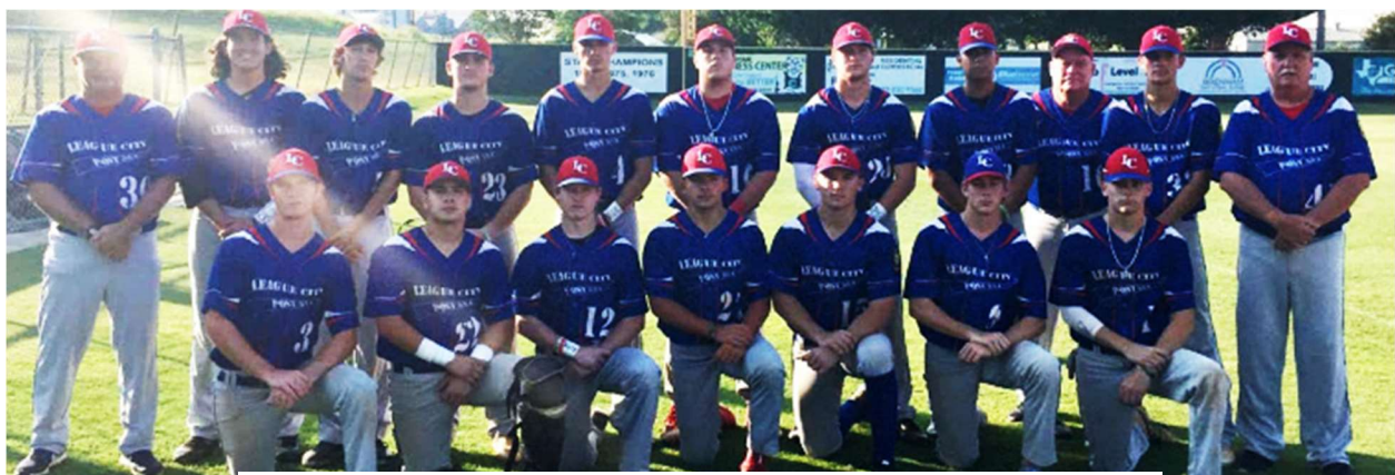
Figure 12 - League City Post 554 - Department of Texas Champions

Commission of the State of Texas, said the tournament started small, but expanded over the years into what it is today. Baseball enthusiasts watch as the Post 8, Cannoneers,