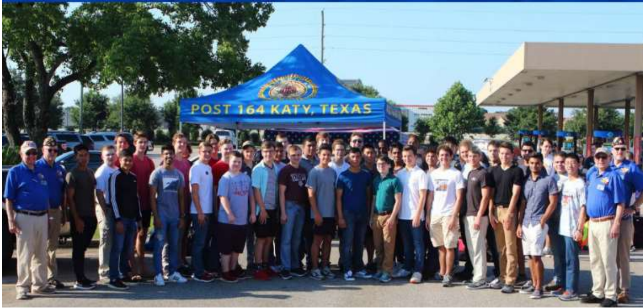
Figure 38 – Katy TX Post 164 Boys State Send-Off 36 teens to Boys State