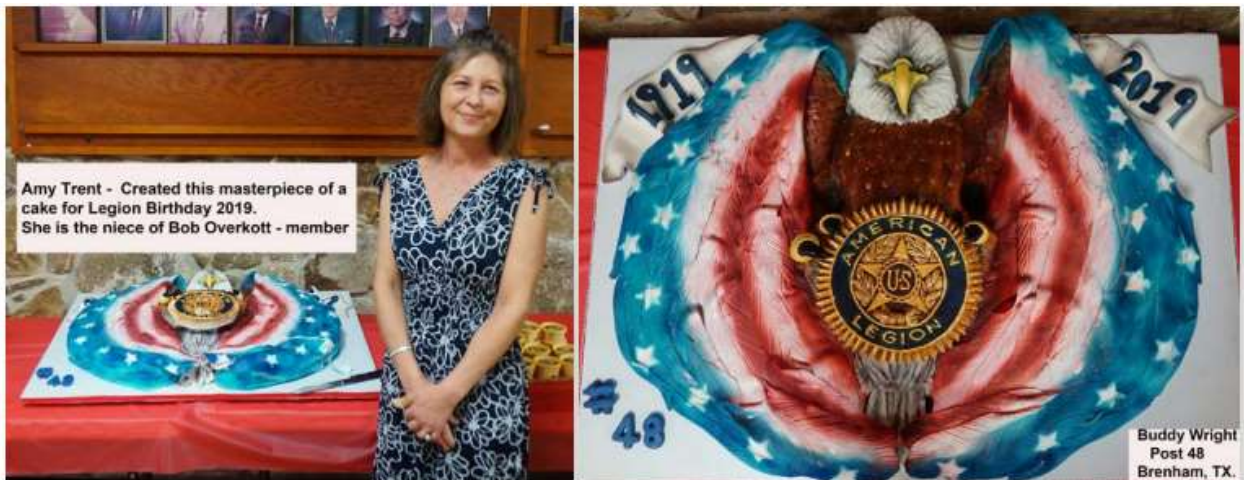
Figure 28 – Buddy Wright Post 48 American Legion Birthday Cake by Amy Trent