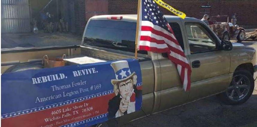
Figure 77 – Post 169 Wichita Falls participate in Veterans Day Parade (11/11/2018)