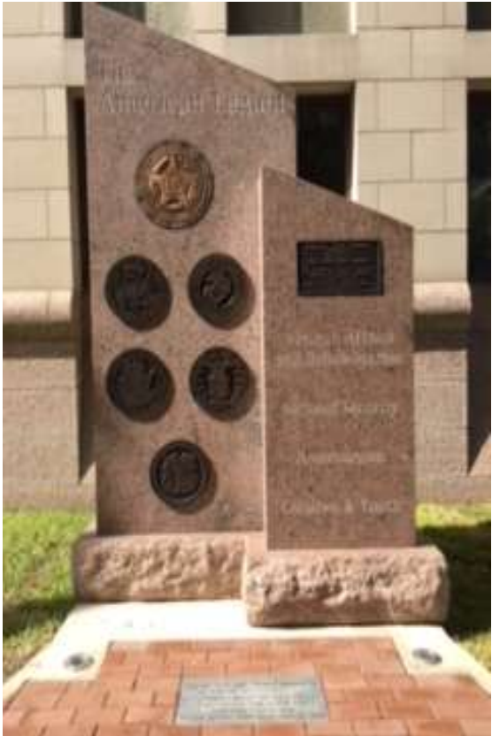
Figure 55 - The Department of Texas American Legion Monument was dedicated at a special ceremony during 100 th Department Convention; It is located on Military Plaza at Dolorosa Street in San Antonio TX