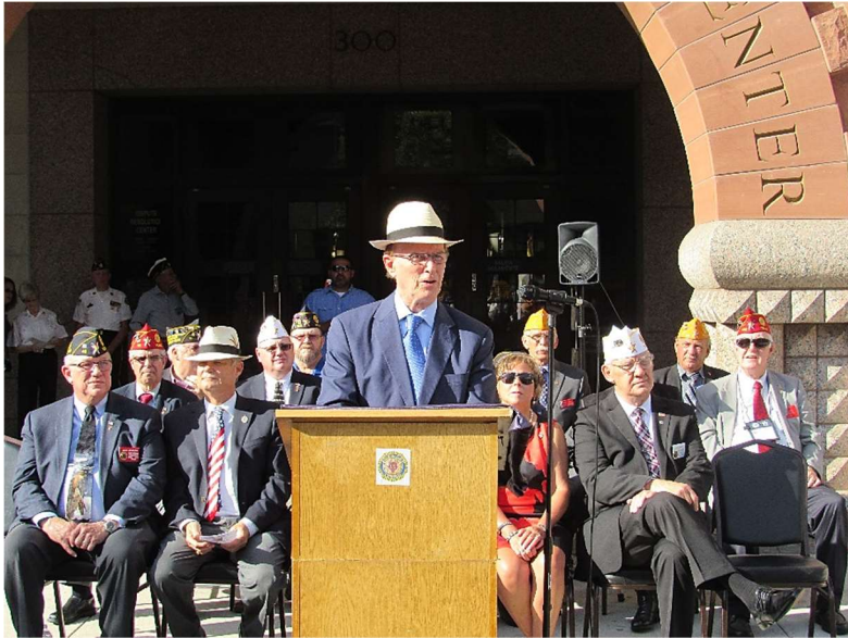
Figure 54 - Bexar County Judge Nelson Wolff speak at dedication ceremony for Department of Texas American Legion monument (7/15/2018)