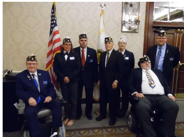
Figure 8 - Division 2 District Commanders