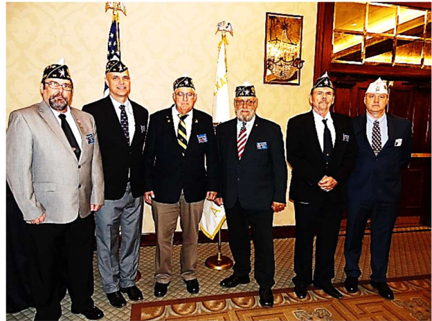
Figure 12 - Division 4 District Commanders