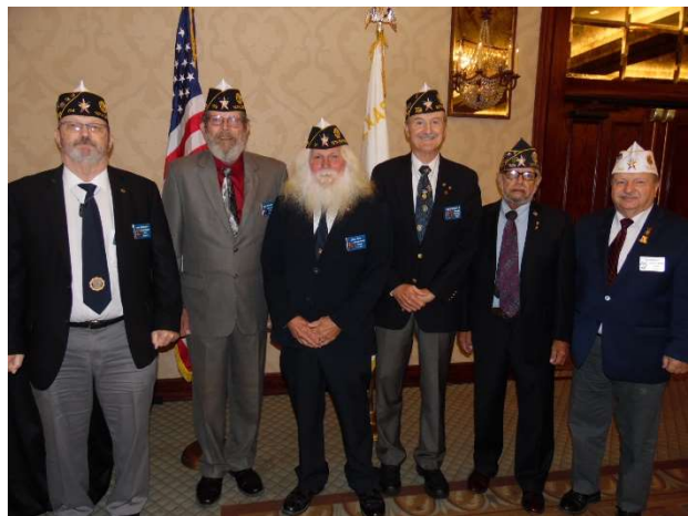
Figure 10 - Division 3 District Commanders