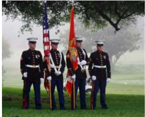
Figure 71 - 31st Annual Onion Creek sponsored by American Legion Post 326 was held On Thursday May 9, 2019 as a major fundraising event at the Onion Creek Club, Austin, Texas. This is a charity golf event benefiting a variety of Veterans and Community Projects.