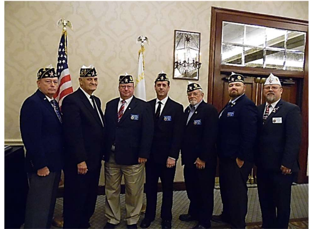
Figure 6 - Division 1 District Commanders