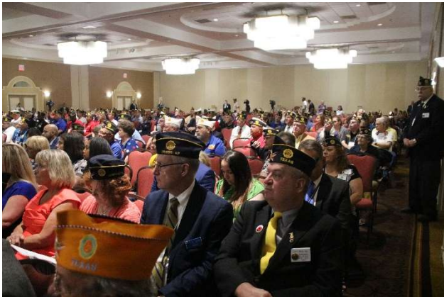
Figure 48 - Legionnaires attend the 100th Convention of the Department of Texas In San Antonio TX (7/13/2018)