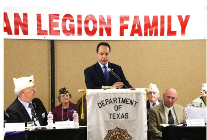
Figure 51 - State Senator Jose Melendez welcome Legionnaires to San Antonio for 100th Anniversary Convention