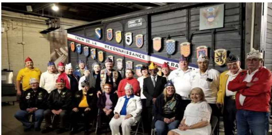
Figure 37 - Voyageurs Militaire and Dames came from all around Texas (over 2,500 miles travelled) to attend the 70th Anniversary of the Texas Merci Boxcar.

a symbol readily understood by American veterans of that era. The boxcars were also used during the Second World War and afterwards repurposed for a spectacular demonstration of gratefulness from the people of France. It was called the Train de la Reconnaissance Francaise” or simply the “Gratitude Train”. In February 1949 the American Legion Department of Texas, the 40 & 8 Grand Voiture du Texas and many