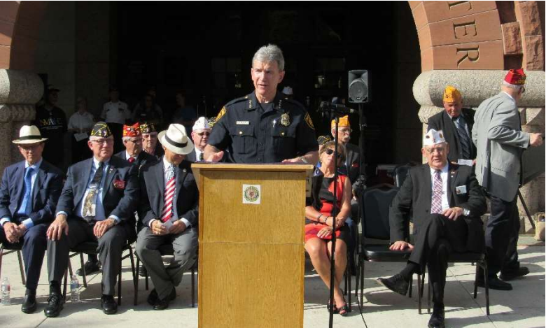
Figure 56 - San Antonio Police Chief William MacManus touts the role of veterans in the SAPD @ the American Legion Monument dedication (7/15/2018)