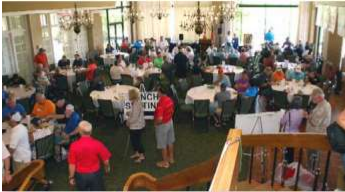
Figure 78 - 31st Annual Onion Creek American Legion Post 326 Memorial Golf Tournament (5/9/2019)