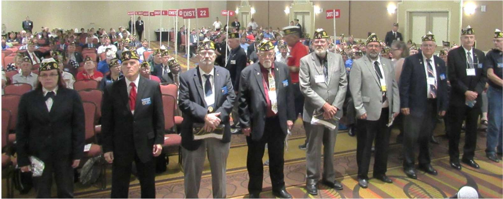
Figure 57 - District Commanders being installed at the 100 th Anniversary Department of Texas Convention (7/16/2018)