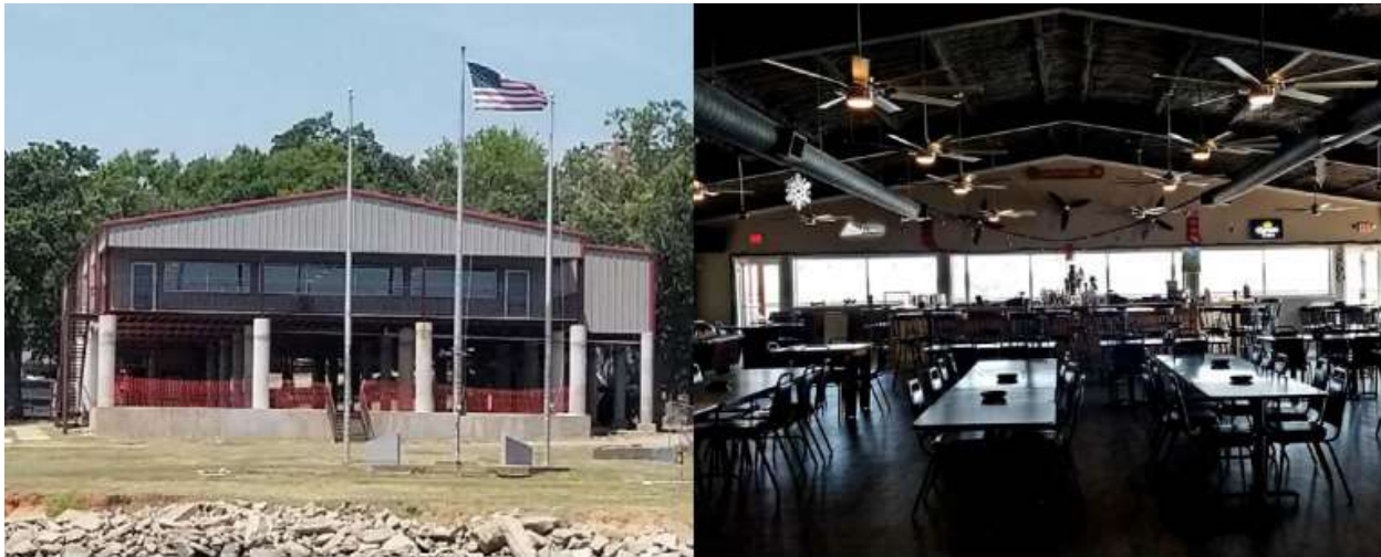
Figure 44 - Rebuilt Post 231 (Pottsboro TX) reopened doors on 1 December 2018