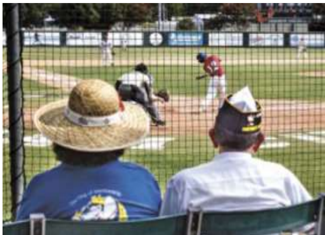
Figure 63 - Fans attend the American Legion Baseball tournament in Brenham TX in July 2018.