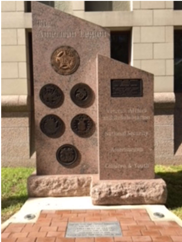
Figure 13 - Department of Texas American Legion Monument